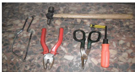
Figure 1: Sampling tools

The ranges of the year of production were 1987-2006 for computers, and 1981-2004 for TVs. This time span is considered being the most relevant for the use of POPs PBDE as their use is thought to have been stopped in about 2004. The numbers of samples with the regions of origin (production or assembly) are shown in Table 1. A total of 382 samples were collected - 224 from Computers and 158 from TV sets. For computer samples, the highest proportion was from Asia (100), followed by America (74), and then Europe (50). Most of the TV samples were obtained for Europe (100), followed by Asia (58), and none from America. This broadly reflects presence of these e-wastes in Nigeria. Second hand TVs are not imported from the US as the systems are not compatible.