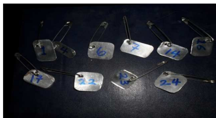
Figure 2: Labelling tags