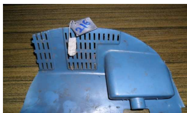
Figure 3: Labeled field samples