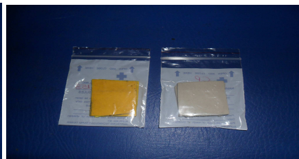
Figure 5: packaged samples