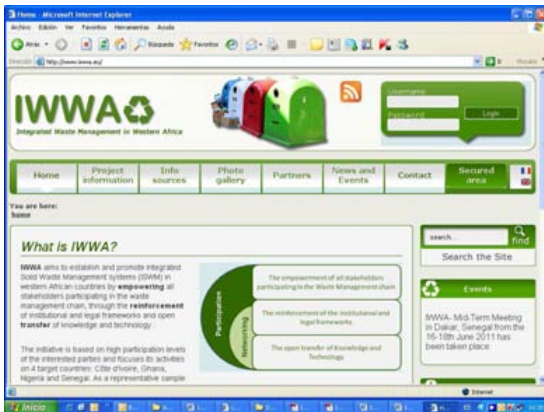
Figure 1: IWWA web site